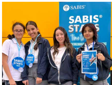
Getting Ready for SABIS® STARS 2024