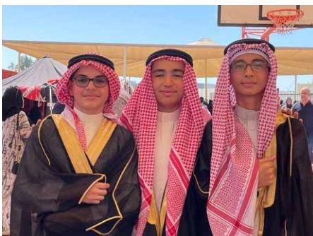
Celebrating Saudi Founding Day